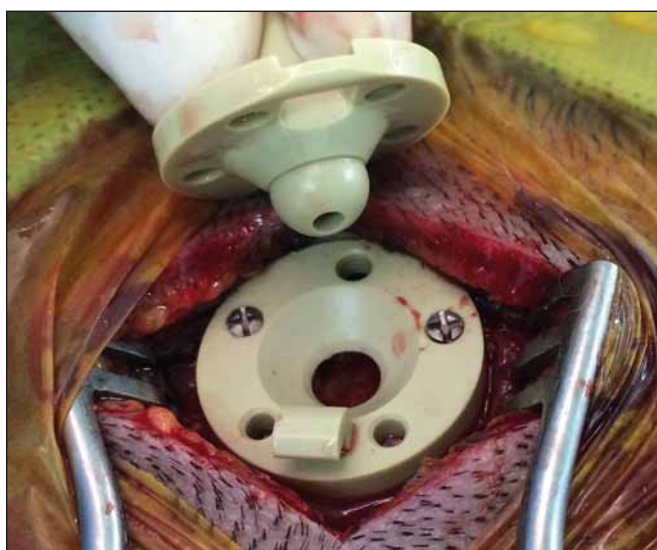
Fig. 1. The adaptor used to fix the guiding stylet during frameless biopsy.

Another limitation of frameless biopsy is that the tilt angle of the catheter from the entry point to the target is narrow. In a frame-based biopsy, there is no limitation on the tilt angle of the catheter, such that the possible entry point area is wide. In our institution, we used a fixing adaptor (Stryker Corporation, Kalamazoo, USA) for the guiding stylet that consisted of a fixed part and a movable part