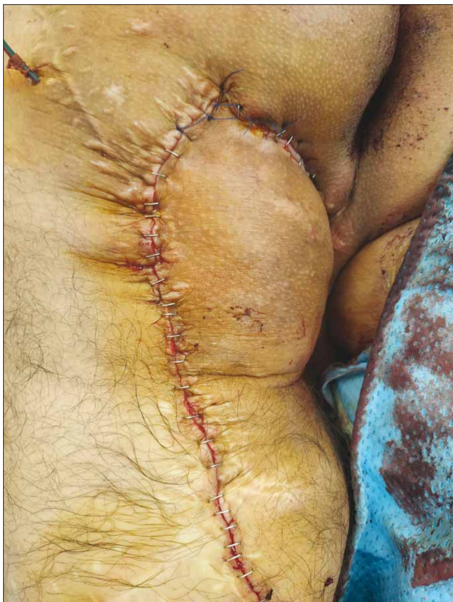
Fig. 4. Defect covered by fasciocutaneous flap. Obr. 4. Defekt uzavřen fasciokutánním lalokem.

tion of the ischiadic bone, which showed no signs of osteomyelitis. The surgery was performed in prone position with conscious sedation. We used the previous scars to lift up the fasciocutaneous posterior thigh flap and we identified the rotated biceps femoris, which was insufficient to cover the ischiadic bone. After dissection of the biceps femoris muscle (Fig. 1) we sutured the muscle over the ischial tuberosity, but it wasn't enough to close the defect. Therefore, we identified the semitendinosus muscle (Fig. 2), detached it from its tendon and after the dissection we turned the caudal portion of the muscle over the cranial part and we covered the entire ischiadic defect (Fig. 3). Both ro-