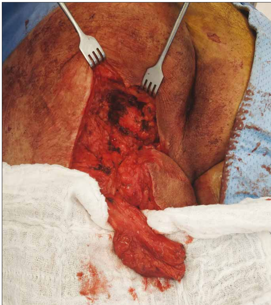
Fig. 1. Biceps femoris muscle after dissection.

Obr. 1. Musculus biceps femoris po disekci.