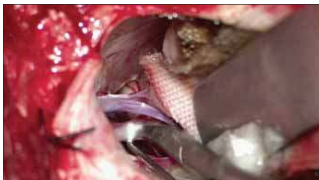
Fig. 2. Partial sensory rhizotomy on the trigeminal nerve using micro-scissors.

Obr. 2. Parciální senzorická rhizotomie trojklanného nervu pomocí mikronůžek.