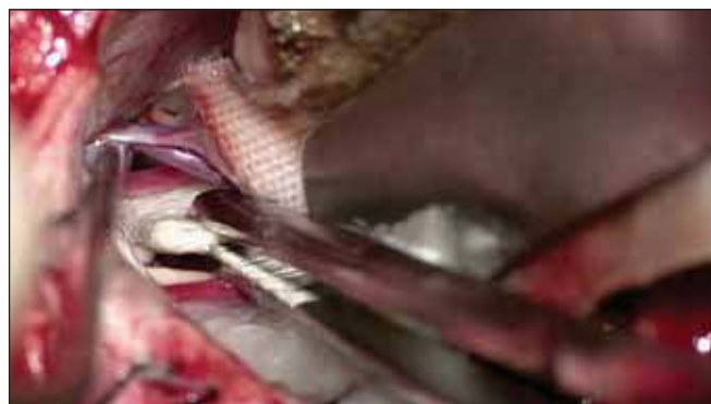
Fig. 3. The superior petrosal vein, trigeminal nerve and superior cerebellar artery, which create pressure on the trigeminal nerve, are seen in the dissection during surgery.

Obr. 2. Parciální senzorická rhizotomie trojklanného nervu pomocí mikronůžek.