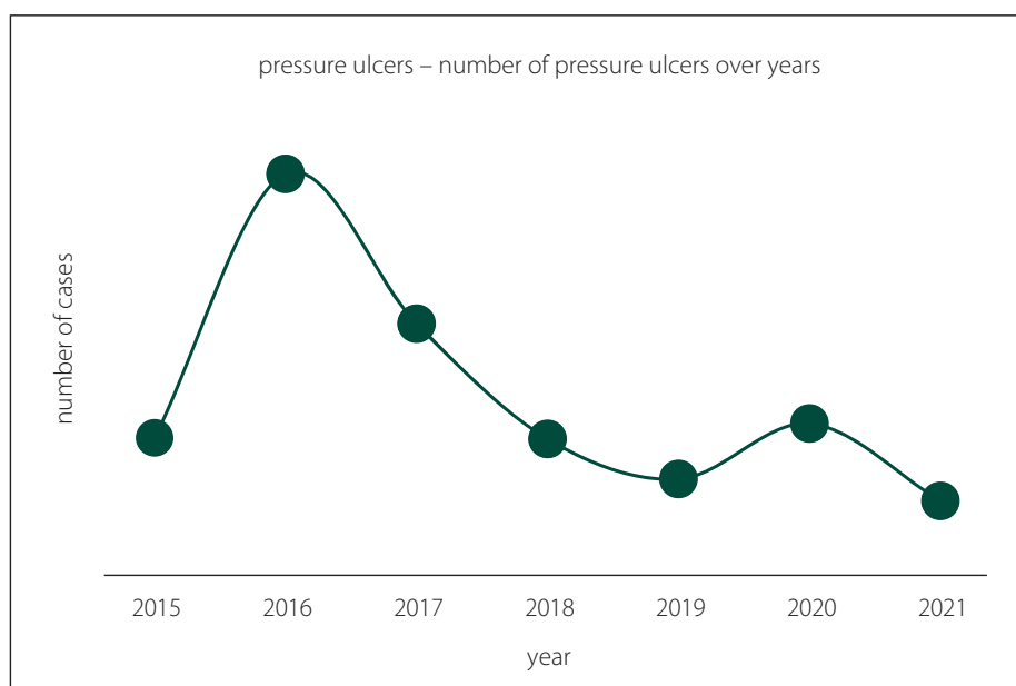
Fig. 1. Number of pressure ulcers over years.

Throughout the period from 2015 to December 31, 2021, the entire St. Anne's University Hospital of Brno; 2,350 PUs were recorded in the hospital information system. This figure represents the number of cases – i.e., all localizations even of multiple PUs and it account for 0.95% out of the total number of hospitalized patients. The development in individual years is described in Tab. 1 and Fig. 1 that show a visible decrease in the inci-