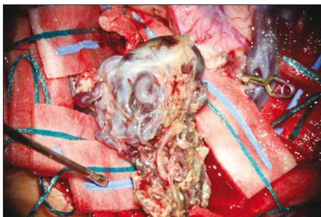
Fig. 2. A photo during the operation, removed pial AVM with draining vein closed by an clip.

The aetiological factor of oedema is supposed to be a venous outflow abnormality. Frequent imaging findings in those cases include varicosity in the major cortical draining vein, dilated venous sac [11] or increased venous pressure secondary to severe stenosis of the draining vein [9]. Several studies suggested that perinidal oedema might be caused by a mass effect due to the AVM itself [9,11] and also by a local brain parenchymal hypoxia due to the arterial steal