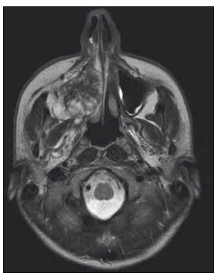
Fig. 2. MRI transverse view – sarcoma in the right maxilla, obstructing right part of nose, deviating nasal septum and expanding into infratemporal fossa.

A 32-year-old woman was referred to the Department of Oral and Maxillofacial Surgery, University Hospital Brno, for gradually enlarg-