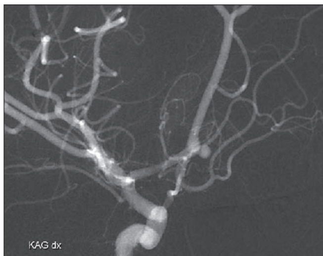
Fig. 1b. DSA – anterior-oriented aneurysm of the anterior communicating artery.

Obr. 1a. Subarachnoidální krvácení v bazálních cisternách na nativní CT mozku.