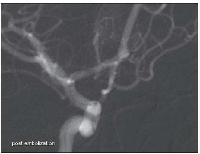
Fig. 1c. Successful embolisation of the aneurysm. Obr. 1c. Úspěšná embolizace aneuryzmatu.