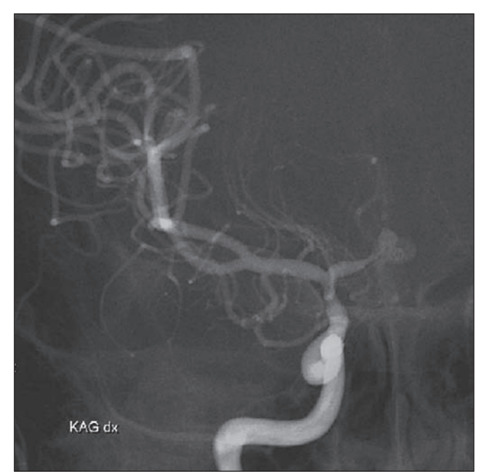
Fig. 2a. Recanalisation of the aneurysm in angiography. A bilocular aneurysm with coils pressed against the top of the fundus. Obr. 2a. Rekanalizace aneuryzmatu na angiografii. Bilokulární aneuryzma s koily, vytlačenými do vrcholu fundu.

Obr. 1a. Subarachnoidální krvácení v bazálních cisternách na nativní CT mozku.