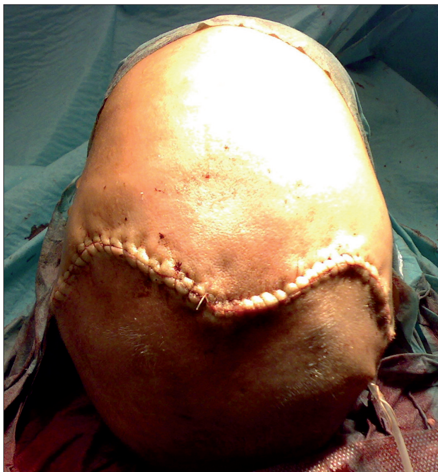
Fig. 3. Postoperative remodeling technique outcome.