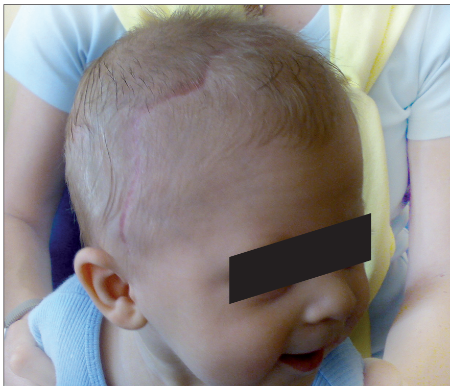
Fig. 5. Postoperative remodeling technique outcome after six months.