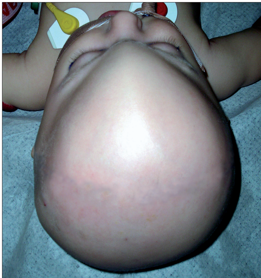
Fig. 4. Preoperative state in patient with trigonocephaly in five months.

In recent decades there has been a growing tendency to avoid strip craniectomies because of their inadequacy in complex craniosynostoses. The timing for surgery has also changed, with treatment of younger children [10–14]. Despite the fact that some surgeons prefer endoscopic operations [15–18], minimally invasive techniques [19] or distraction devices [20–25], the remodeling technique still remains a gold standard, based on its greater effectiveness [26,27]. Suitable resorbable plates are available for the fixa-