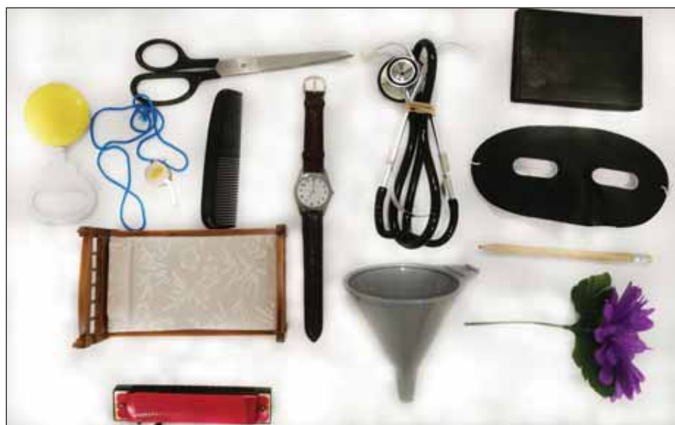
Fig. 1. Twelve items for the "Naming task" (flower, bed, whistle, pencil, rattle, mask, scissors, comb, wallet, harmonica, stethoscope, funnel).

In the Naming task, the participants had to name 12 randomly presented real objects (flower, bed, whistle, pencil, rattle, mask, scissors, comb, wallet, harmonica, stethoscope, funnel).