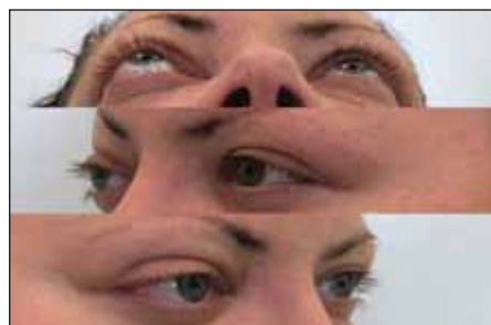
Fig. 1. Protrusion of the right bulbus. Obr. 1. Protruze pravého bulbu.

adopted, followed by additional diagnostic tests for existing thrombophilic conditions, in that the lupus anticoagulant test was positive. The patient was indicated for life-long anticoagulant warfarin therapy.