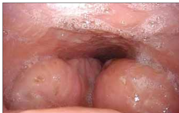
Fig. 2. Endoscopic view of the base of the tongue. Preoperative videoendoscopic finding from nasopharynx. Hypertrophic base of the tongue (Friedman 4) almost completely obstructing the pharynx.

Obr. 1. MR hlavy a krku; T2 vážený sken, sagitální řez. Homogenní měkkotkáňová masa v oblasti kořene jazyka (šipka).