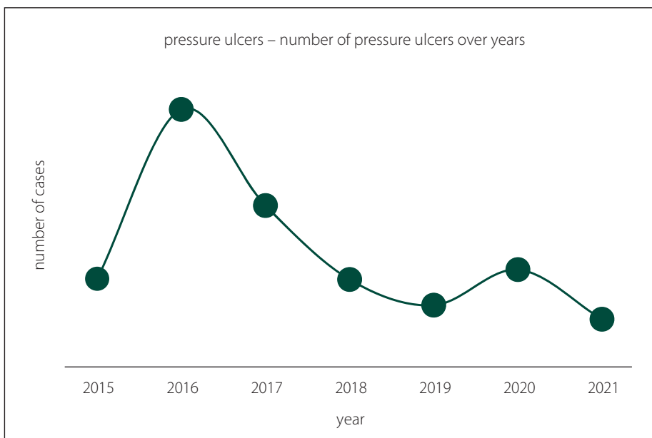
Fig. 1. Number of pressure ulcers over years.

Throughout the period from 2015 to December 31, 2021, the entire St. Anne’s University Hospital of Brno; 2,350 PUs were recorded in the hospital information system. This figure represents the number of cases – i.e., all localizations even of multiple PUs and it account for 0.95% out of the total number of hospitalized patients. The development in individual years is described in Tab. 1 and Fig. 1 that show a visible decrease in the inci-