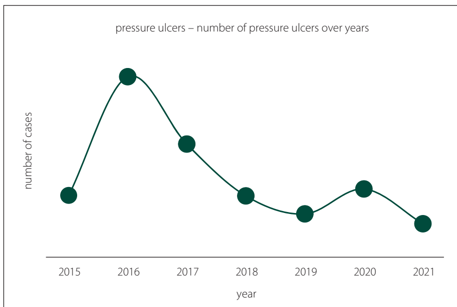
Fig. 1. Number of pressure ulcers over years.

Throughout the period from 2015 to December 31, 2021, the entire St. Anne's University Hospital of Brno; 2,350 PUs were recorded in the hospital information system. This figure represents the number of cases – i.e., all localizations even of multiple PUs and it account for 0.95% out of the total number of hospitalized patients. The development in individual years is described in Tab. 1 and Fig. 1 that show a visible decrease in the inci-