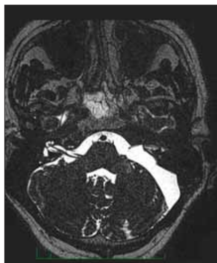
Fig. 2. MRI of the brain – 3 months after the vestibular schwannoma resection. Obr. 2. MR mozku – 3 měsíce po resekcii vestibulárního schwannomu.