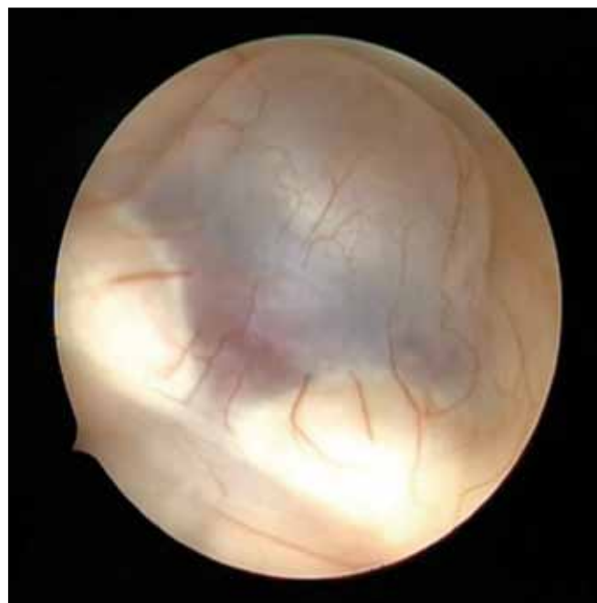
Fig. 2. Base of the III. ventricle, the mammillary bodies are clearly seen, between them the basilar artery, rostrally tuber cinereum – place for the planned opening.