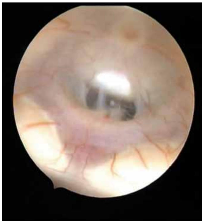
Fig. 3. The III. ventricle base after opening.