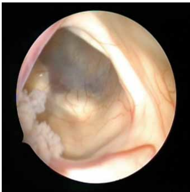
Fig. 1. Insight to the III. ventricle through the f. Monro, which is bordered clockwise by fornix, thalamostriate vein, chorioidal plexus and septal vein.

Authors attempted to prove that the neuroendoscopy is a mini-invasive alternative to the drainage system implantation in particular and, in indicated cases, a notable decrease in morbidity as well as increased quality of life in children with brain tumours can be expected. It has been assumed that, in children with a posterior fossa tumour, the endoscopic third ventriculostomy could replace external ventricular drainage and, eventually, the permanent V-P shunt. In patients with deep-seated intraventricular expansions, diagnostic refinement is expected using an endoscopic biopsy sample. Eventually, endoscopy can be used for an opening or targeted drainage of a tumour cyst.