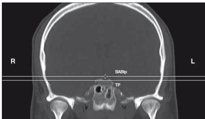
Fig. 3. Position of the BAB in relation to the TP. Coronal reconstruction of CTA of the head.

BAB – basilar artery bifurcation; BABtp – transverse BAB plane; L – left; R – right; TP – transverse plane; TP-BABtp – distance between the TP and BABtp expressed in mm + a marker