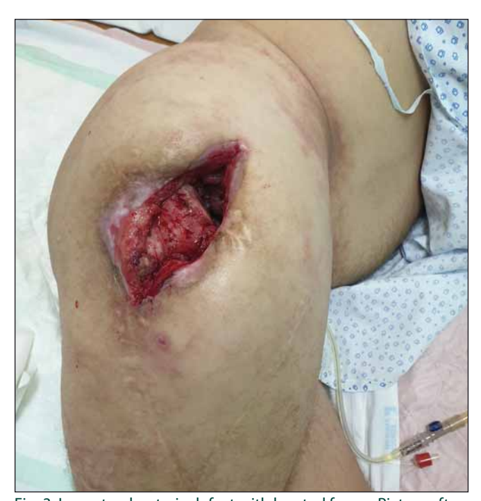
Fig. 3. Large trochanteric defect with luxated femur. Picture after osteotomy of proximal femur, including caput femoris. Obr. 3. Pozsáblý trochanterický dekubitus s dominující luxova-

Obr. 3. Rozsáhlý trochanterický dekubitus s dominující luxovanou kyčlí. Obrázek již po provedené osteotomii hlavy a proximální části femuru.