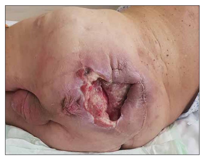
Fig. 1. Large and deep pressure ulcer in whole sacral region. Obr. 1. Rozsáhlý dekubitus postihující prakticky celou oblast sakra a hýždí.