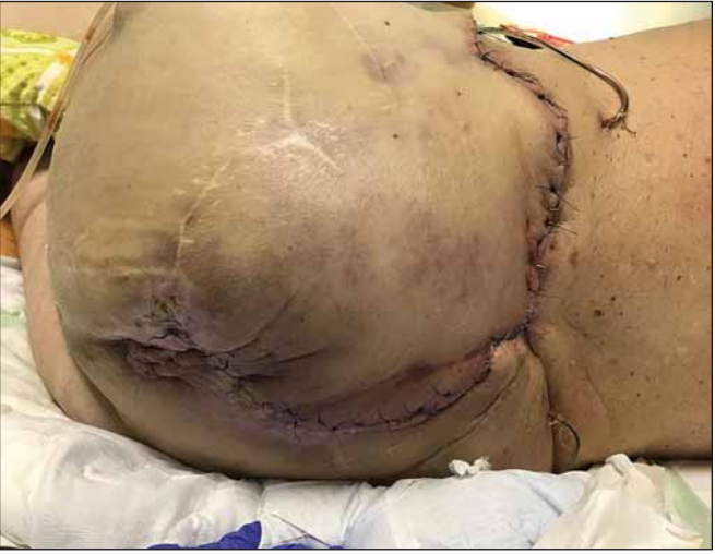
Fig. 2. Defect after closure with large transposition flap. Obr. 2. Defekt po definitivním uzávěru transpozičním lalokem.