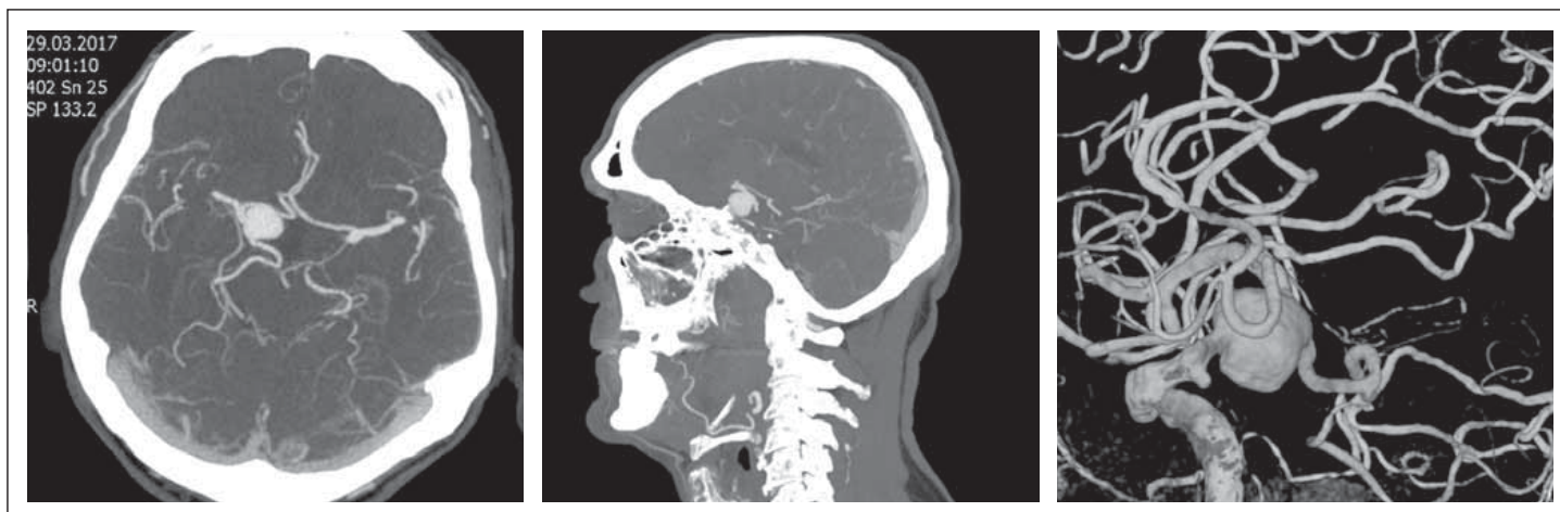
Fig. 1. Preoperative CTA and DSA. Complex ventral carotid wall aneurysm (11 × 15 × 14 mm) on the right 2 mm distal to the origin of the ophthalmic artery and involving the posterior communicating segment of the internal carotid artery with a fetal-type posterior communicating artery arising from the aneurysm sac. The anterior choroidal artery was distal to the aneurysm.

Obr. 1. Předoperační CTA a DSA. Komplexní aneuryzma ventrální stěny karotidy (11 × 15 × 14 mm) umístěné vpravo 2 mm distálně od odstupu arteria ophthalmica a zahrnující zadní komunikující segment arteria carotis interna a arteria communicans posterior fetálního typu, odstupující přímo z vaku aneuryzmatu. Arteria chorioidea anterior odstupuje distálně od výdutě.