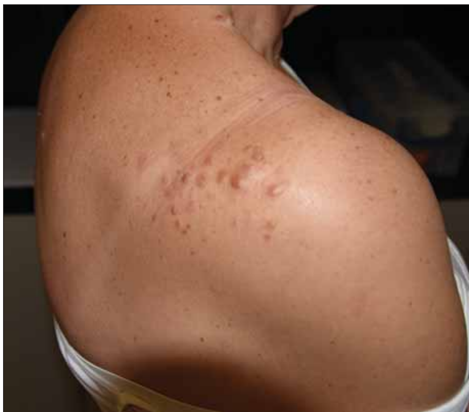
Fig. 1. Multiple shoulder neurofibromas. Obr. 1. Mnohočetné neurofibromy ramene.

DNA for molecular genetic diagnostics was isolated from formalin-fixed paraffin-embedded (FFPE) tissue biopsy samples