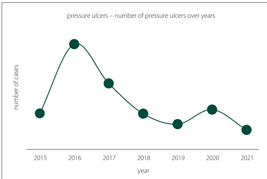
Fig. 1. Number of pressure ulcers over years.

Throughout the period from 2015 to December 31, 2021, the entire St. Anne’s University Hospital of Brno; 2,350 PUs were recorded in the hospital information system. This figure represents the number of cases – i.e., all localizations even of multiple PUs and it account for 0.95% out of the total number of hospitalized patients. The development in individual years is described in Tab. 1 and Fig. 1 that show a visible decrease in the inci-