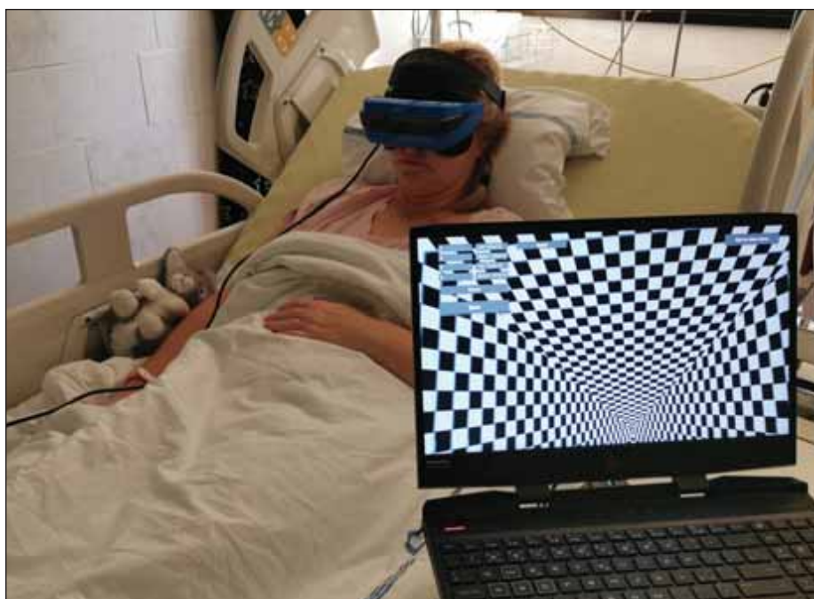
Fig. 3. Virtual reality in vestibular rehabilitation in patient after vestibular schwannoma surgery.

Obr. 3. Použití virtuální reality při vestibulární rehabilitaci u pacienta po operaci vestibulárního schwannomu.