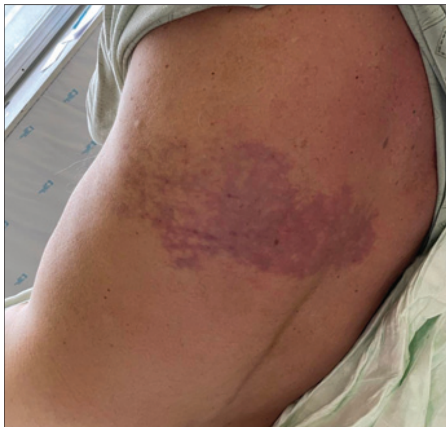
Fig. 1. Skin changes in dermatomes T8-9 on the left side of the back mimicking infectious etiology.

An 82-year-old man with a history of arterial hypertension and type 2 diabetes mellitus was admitted to the hospital with acute weakness of the left lower limb. The night before admission, at around 3 AM, the patient experienced sudden pain in the left lower thoracic region of his back. The next morning, his wife noticed a dark red patch on the skin corresponding to the painful area. At 1 PM, the patient noticed some weakness of the left lower limb for the first time. By 3 PM that day, he was unable to walk properly due to instability.